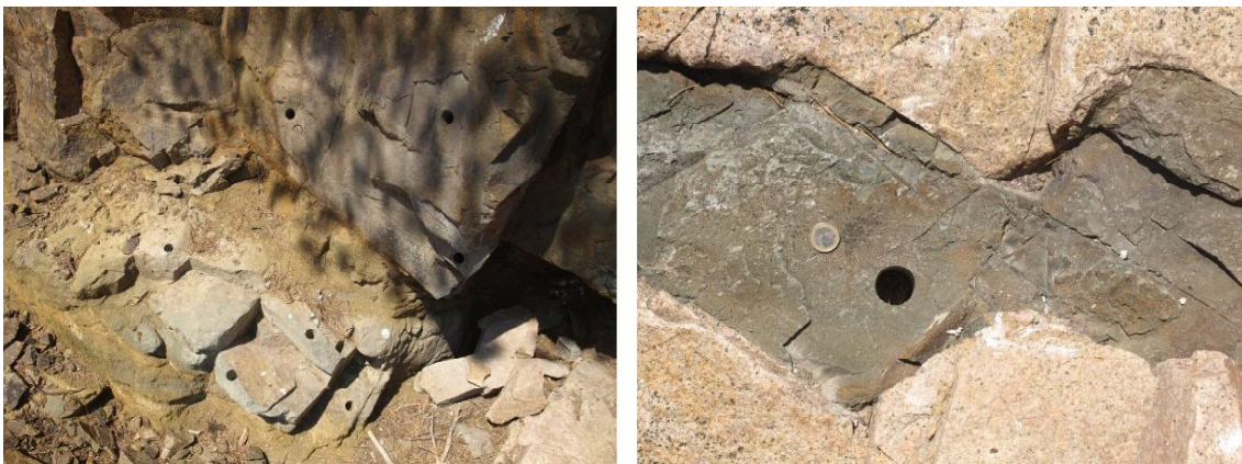
Two images of the recently damaged lamprophyre dykes from Costa Brava (Catalonia, Spain). Photographs by E. Druguet (11th June 2009).

Please geologists, if sampling, be sensible with geological sites. Drill sampling is particularly threatening because of its great visual impact, whilst many times unnecessary. Do not take samples from type localities or from sites of special scientific, didactic or aesthetical interest. Before sampling ask the experts and authorities for permission. Geological heritage is the only record of Earth history and processes and needs to be preserved for future generations.